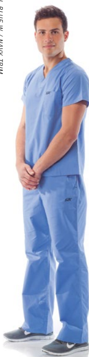
CELIL BLUE W / NAVY TRIM